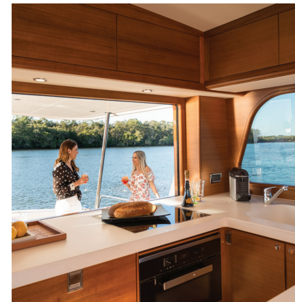
Clockwise from top left, note walk-in hanging locker in the master; our VIP forward had optional Pullmans; yeah, a galley-forward option is available, but the view from the after galley is too cool for words; the saloon is literally circumscribed with windows, some retractable.