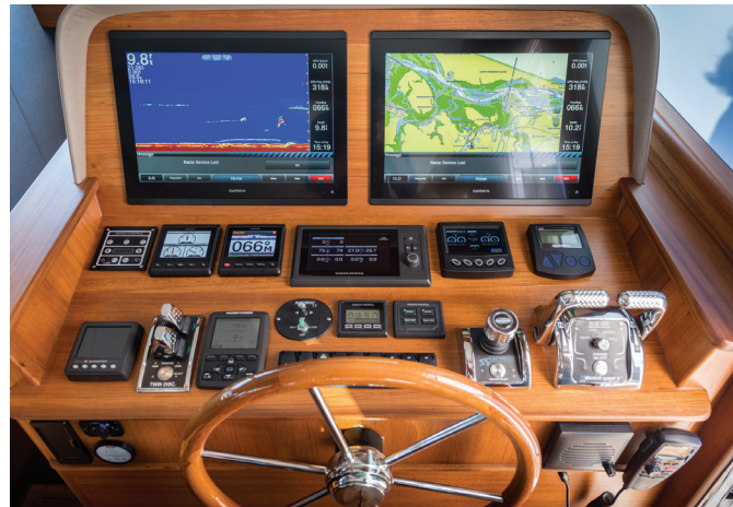
Components are kept functionally discrete at the 60's two helm stations, the point being to avoid total shutdown if one component fails.

instantaneously spin at virtually any rotational speed, fast or slow, and team them up with a set of vibration-reducing Seatorque Enclosed Shafts, a black box loaded with serious computer firepower, and two trusty, trusty hydraulic thrusters, and it's no wonder robust and steady dockside maneuverability results, minus the turbulence and clunky boat movements you sometimes get with pods.