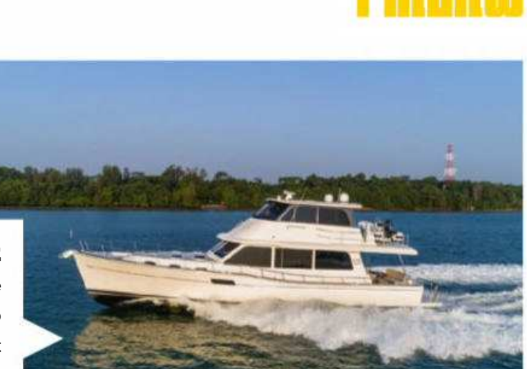
Length 19.9m Builder Grand Banks Design Grand Banks

The new GB60 gets extra living space from an enclosed upper saloon. To keep the weight from infringing on the 31-knot performance, its superstructure is fully infused using carbon fibre. Standard power comes from 900hp Volvo D13s.